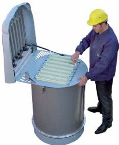
Easy and Safe Maintenance