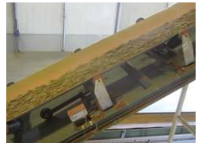
Twin Idler 600mm wide Belt Weigher - trough belt with 28 degree incline application