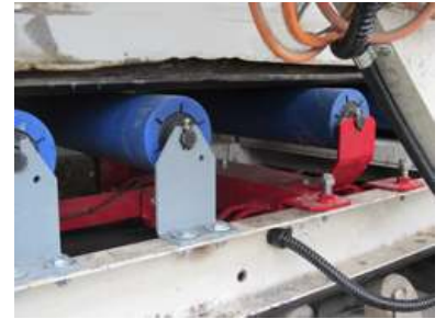
600mm wide Flat Belt Feeder

The Belt Weigher can be used to batch out a predetermined load with pre-act to accurate batching into rail or truck, maximising loading and preventing over weight loads.