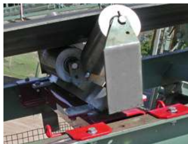
Single Idler 600mm wide Belt Weigher—trough belt application