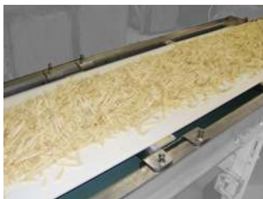
Single Idler 600mm wide Stainless Steel Belt Weigher application