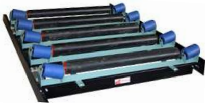
1800 wide Multi Idler Belt Weigher application

- expect accuracy better than \pm 0.5\% .