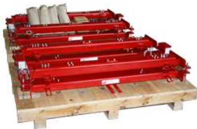
1500mm wide Zinc plated, Powder Coated Twin Idler Belt Weighers prepared for transport