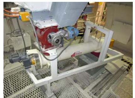
Pivoted Weigh Screw Feeder- Hydrated Lime application

The controller has a diagnostic output that can be used to capture data directly into laptop to allow analysis of data.