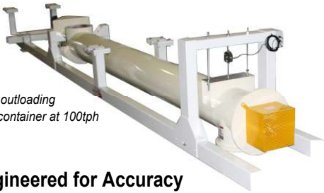
Malt outloading into container at 100tph