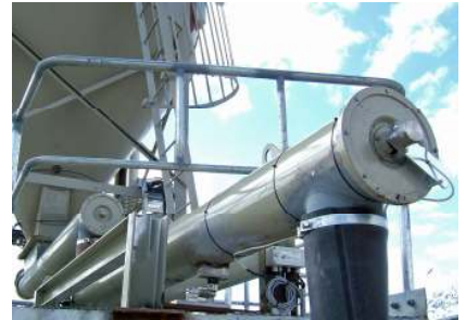
Pivoted Weigh Screw Conveyor- Cement application