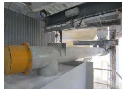
Pivoted Weigh Screw Conveyor- Malt Bulk Outloading application