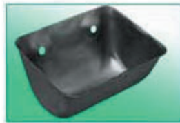
B TYPE Medium Pattern Agricultural & Industrial