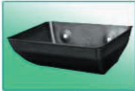
STARCO Steel Agricultural & Industrial