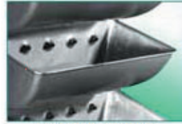
STARCO JUMBO Steel Agricultural & Industrial