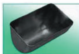
C TYPE Medium Deep Pattern Agricultural & Industrial

Kinder and Co. Pty. Ltd. Copyright © 2004 ABN 28 006 489 238