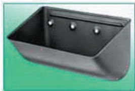
J TYPE American Grain Steel Agricultural