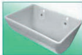
SUPER STARCO HDP/Nylon/Polyurethane Agricultural & Industrial