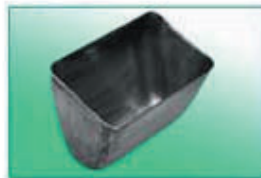
F TYPE Angle Back Pattern Industrial