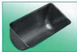
D TYPE Deep Pattern Industrial