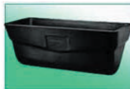
BUDD AA Nylon Industrial/Sticky