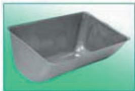
SUPER STARCO Steel Agricultural & Industrial