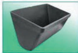
ATLAS AD Industrial/Sticky