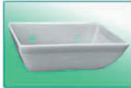
STARCO HDP/Nylon/Polyurethane Agricultural & Industrial