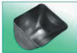
A TYPE Shallow Pattern Powders