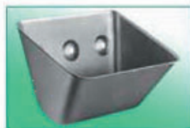
CONTINENTAL DIN 15233 Steel Industrial