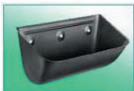
COLUMBUS DIN 15232 Steel Agricultural