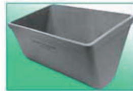
POLYPENCO Nylon Industrial/Sticky