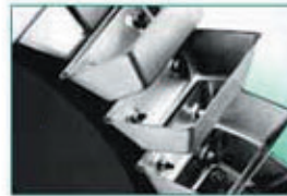
GB SPIDEX Bottomless Steel Powdery/Sticky