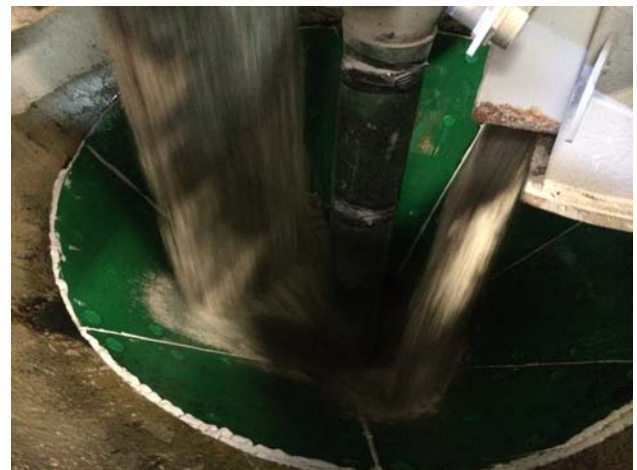
Kryptane is a registered trademark of Argonics, Inc.