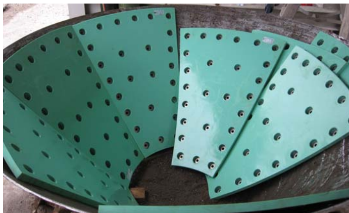
Photo showing installation option of a weldable version of K-Superline®.